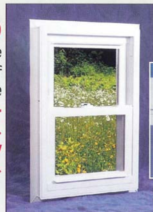
Integral Nail-Fin & J Channel

The DH 990 has all the features and benefits of the DH-900 PLUS the addition of an Integral Nail-Fin and J-Channel... Perfect for siding and new construction.